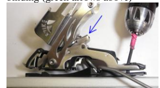
Raise ski brake activator (blue arrow) when mounting the SPIKEbulldog with a ski brake.