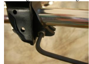
Loosen the screw in the bottom of the heel to adjust length.