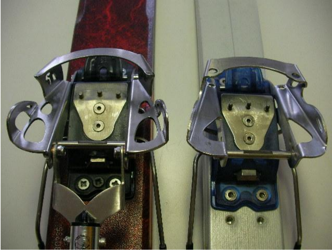
Picture above shows Telebulldog toe box open and ready to receive boot. (left NTbulldog , right LiteDogz)

These instructions describe how to step into Telebulldog bindings toe box.