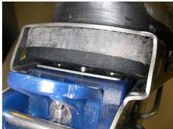
LiteDogz and classic Telebulldog bindings have longer pins that align with pin holes in the ski boot and hold the boot in the binding without the heel attachment.