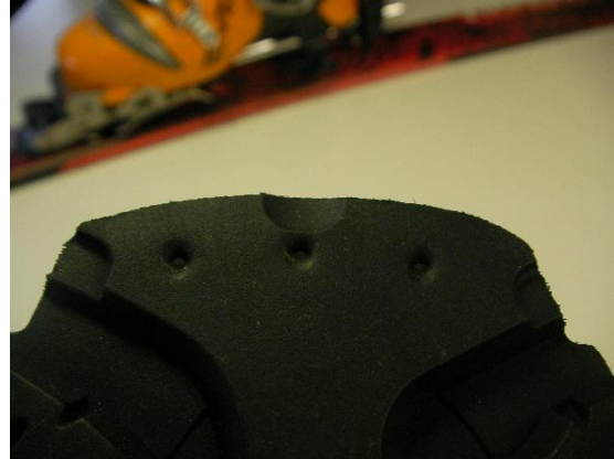
The RTbulldog series of bindings with heel attachment have short pins that accommodate boots without pin holes like the NTN boot on the left.