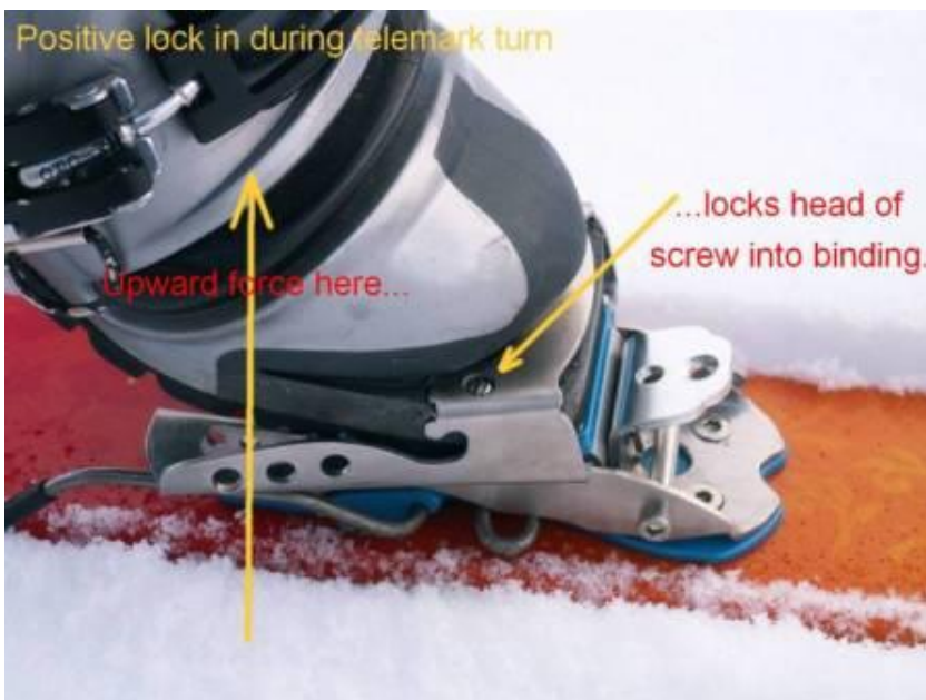
Figure 5 Step into binding and screw head will lock into hole.