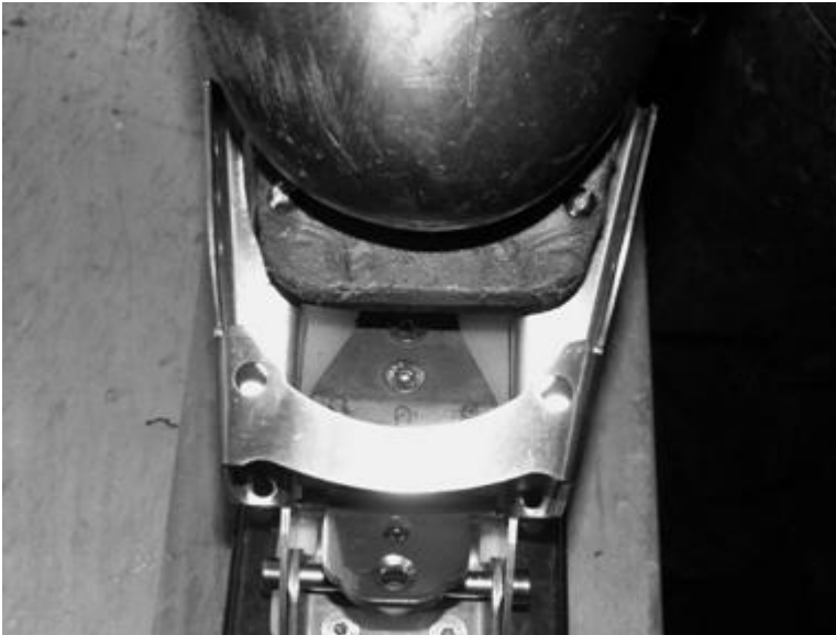
Figure 4 Head of screw will line up with lock hole when inserting boot.