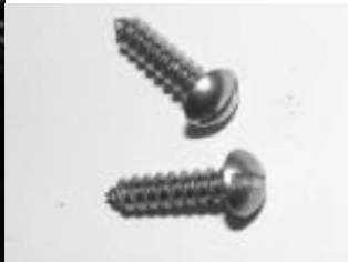
Figure 3 Remove boot from binding and screw into tap holes, 3/4" #8 stainless steel wood screw.